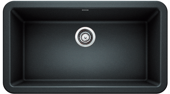
Model 401895 shown