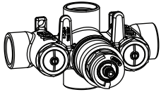
Trim [ 240.4201T** ]