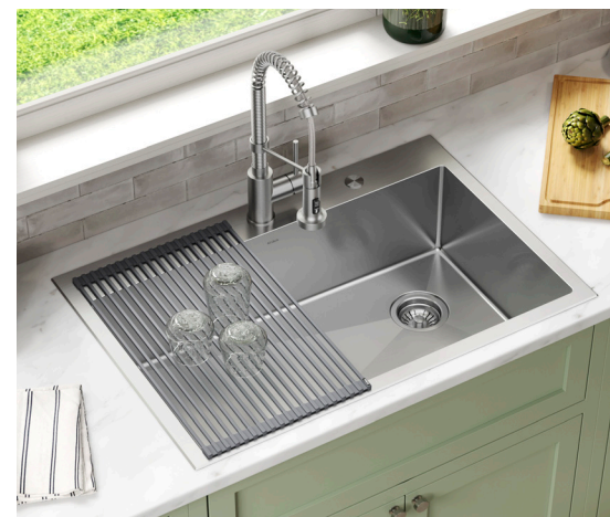
Loften™ Drop-In Sink (KHT410-33)