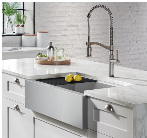
Kore™ Workstation Sink (KWF410-33)