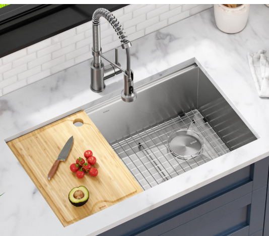
Kore™ Workstation Sink (KWU110-32)