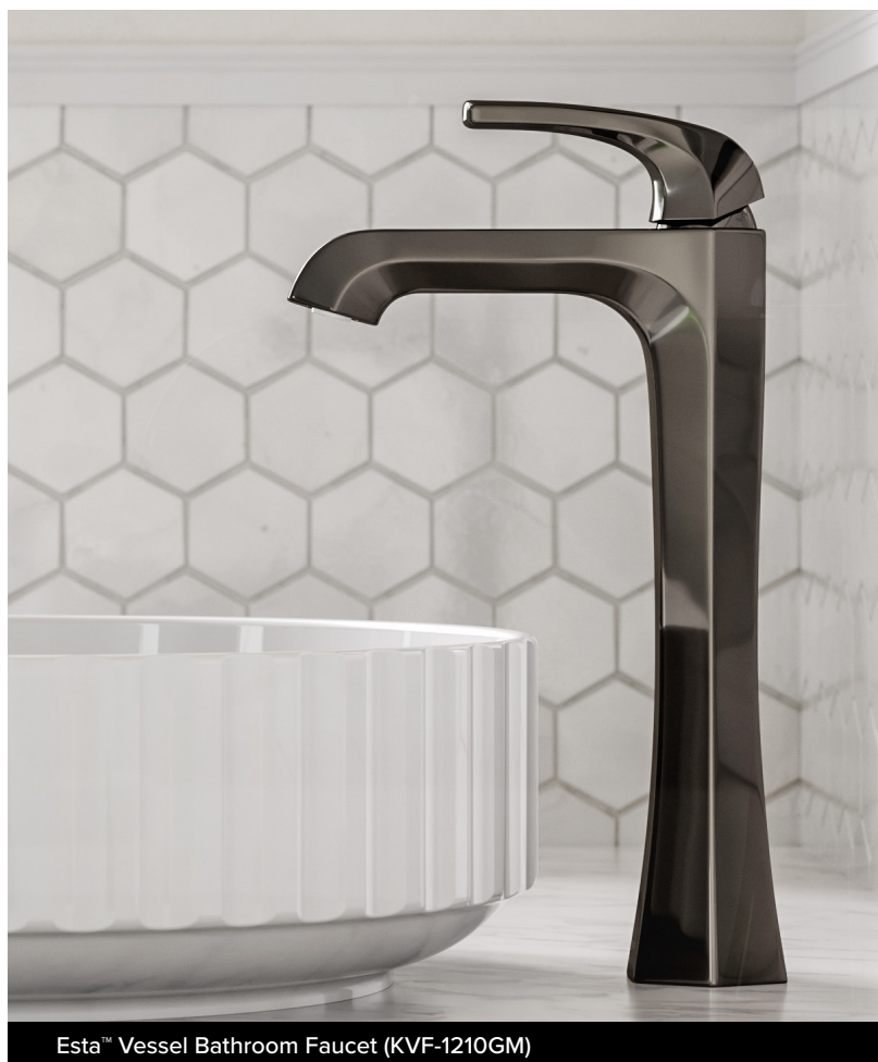
Esta™ Vessel Bathroom Faucet (KVF-1210GM)