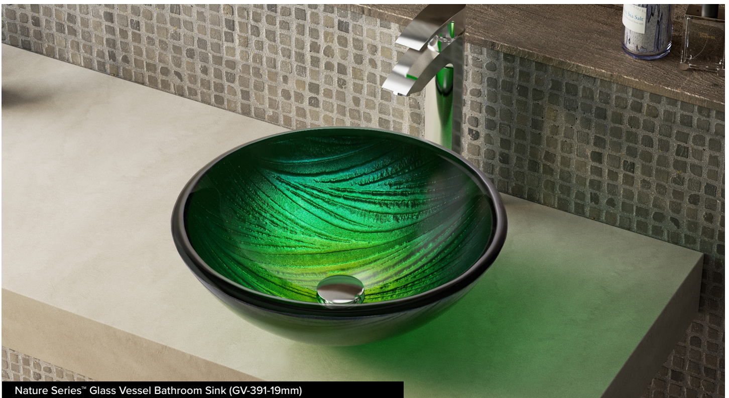
Nature Series™ Glass Vessel Bathroom Sink (GV-391-19mm)