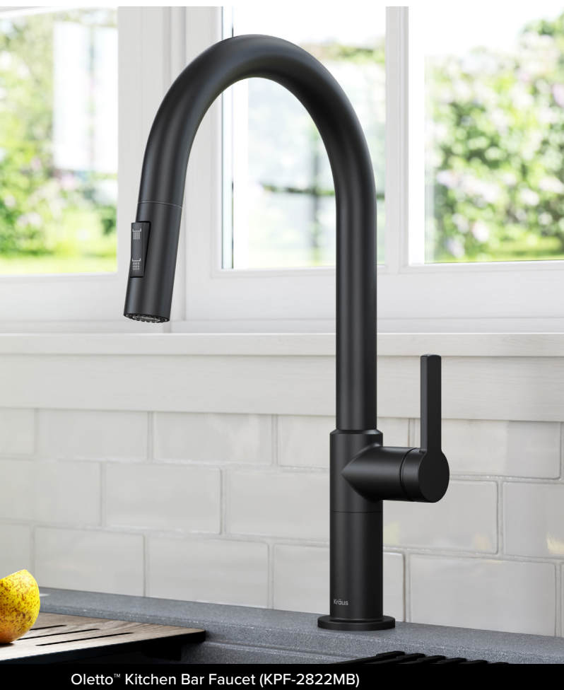
Oletto™ Kitchen Bar Faucet (KPF-2822MB)